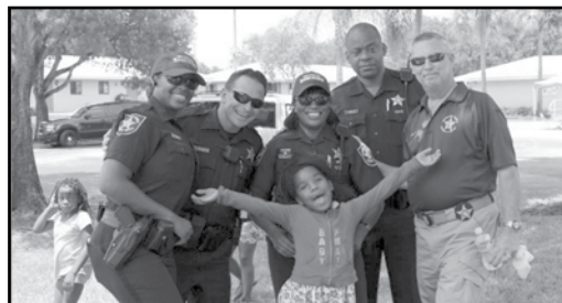
Summer BreakSpot provides nutritious meals for children and young adults.

• The Broward County Housing Authority (BCHA) was recently honored with the 2017 Nan McKay & Associates (NMA) Resident Service Award for its involvement in the innovative Summer BreakSpot Mobile Program of Broward County . The BCHA partnered with Children Services Council of Broward, Florida Impact and South Florida Meals on Wheels in response to the growing need for nutritious meals for children and young adults up to age 18. Today, the Mobile Program has grown to 75 locations and is on track to surpass 100 sites in 2018.