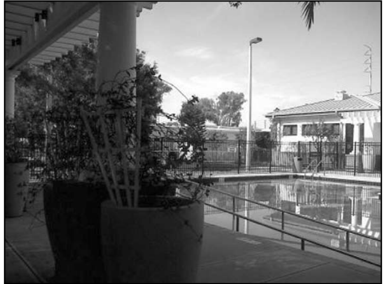
The pool at Palm Lake Village Apartments in Dunedin, Fla.