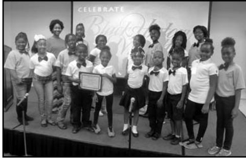
Members of the HACFM Youth Choir are all smiles after their performance at Hodges University.

"We Choose to Remember, The Civil Rights Act of 1964" took place on Feb. 27 at Hodges University's Fort Myers campus. Presented by the Office of Diversity and Inclusion and the John Ebling Memorial at Hodges University American Legion Post 397, the event included speakers and musical performances honoring Black History Month and the civil rights movement.