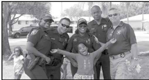
Summer BreakSpot provides nutritious meals for children and young adults.

• The Broward County Housing Authority (BCHA) was recently honored with the 2017 Nan McKay & Associates (NMA) Resident Service Award for its involvement in the innovative Summer BreakSpot Mobile Program of Broward County . The BCHA partnered with Children Services Council of Broward, Florida Impact and South Florida Meals on Wheels in response to the growing need for nutritious meals for children and young adults up to age 18. Today, the Mobile Program has grown to 75 locations and is on track to surpass 100 sites in 2018.