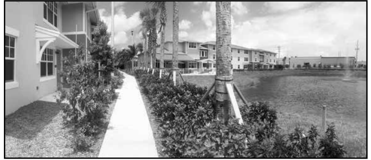
Flowering shrubs line the waterfront walkway of Oakland Preserve.

All buildings in Oakland Preserve are smoke-free and energy-efficient. Amenities include a gym, a playground, a tot room, a cyber lounge, on-site maintenance and shared common areas