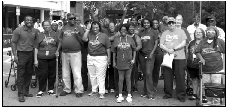
GHA residents and staff enjoy the first of many 5K wellness walks at Oak Park Apartments.

BERMAN & HOPKINS WRIGHT & LAHAM CPAS AND ASSOCIATES, LLP