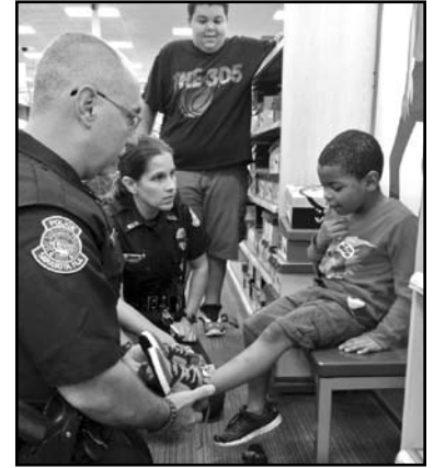
Sarasota police officers help a child choose new shoes for the holidays.