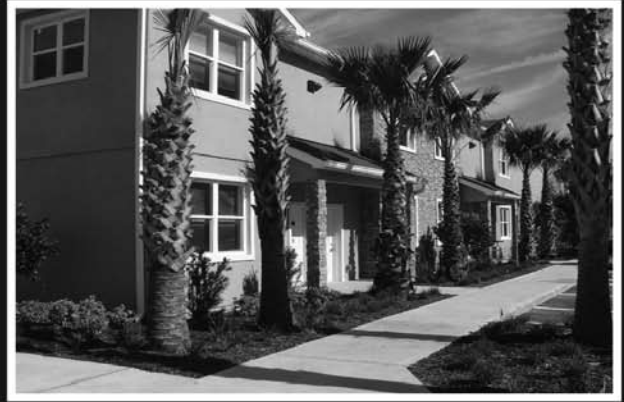
Northwood II - Daytona Beach Housing Authority NAHRO Merit Award Winner