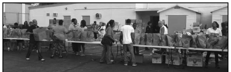
HACFM and community partners provide bagged Thanksgiving dinners to around 1,000 families in the Fort Myers area.