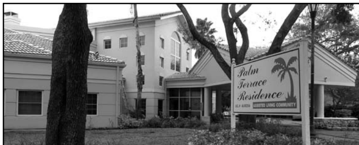
Palm Terrace assisted living facility in Tampa

In 2003, Mia convinced HUD and the Department of Health and Human Services to work together to fund projects like Palm Terrace. In terms of management, Mia Senior Living Solutions was not involved at the outset of the Palm Terrace project, but