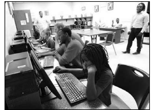
Students use computers after school at Woodland Boys & Girls Club.

To qualify for JTEP, participants must be a resident of city public housing or a Section 8 recipient. Participants have three track options: Education, Employment and Entrepreneurship. During the