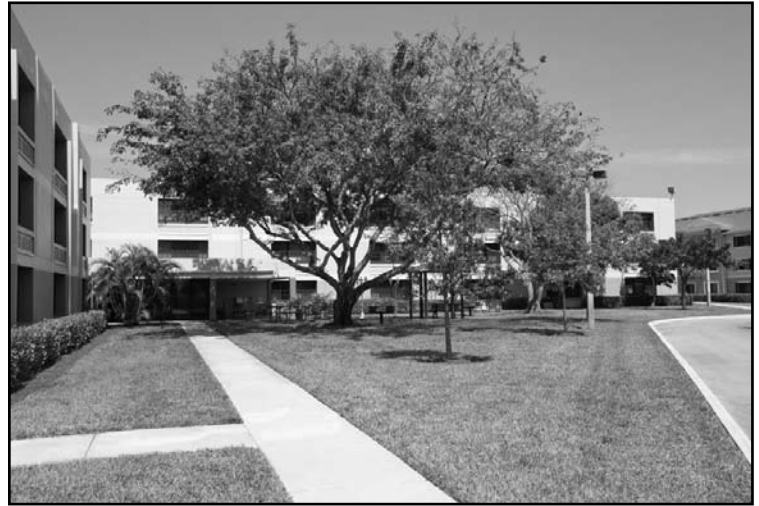
Highland Gardens is one of two RAD conversions in Broward County.

HUD has noted that about one-third of the initial awards proposed less than $10K in rehabilitation needs. Griffin Gardens and Highland Gardens were fortunate to fall into this category. They are both newer properties, with no large backlog of deferred maintenance items. The sites have been the beneficiaries of American Recovery and Reinvestment Act (ARRA) grant funds and significant Disaster Recovery Initiative funds. These infusions of funding have allowed for accessibility upgrades and hardening of the buildings. Additionally, RAD permitted the