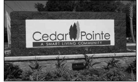
THA's Cedar Pointe is the agency's first Smart Living Community.

Two years ago the Tampa Housing Authority acquired a dilapidated apartment building in East Tampa. The property was in such bad condition that a decision was made to tear down the structures and rebuild with a new concept in mind while keeping the community's original name: Cedar Pointe Apartments.