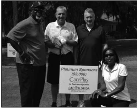
Golf tournament sponsors such as CAC Florida Medical Centers/Care Plus (pictured) and Boy Scouts of America/Siltek are helping to save the lives of Tampa youth, one hole at a time.

The majority of the costs for each youth to participate in many of the summer-long activities are offset by the agency's annual fund-raisers, such as the golf and fishing tournaments. This year's golf tournament was held at the beautiful Saddlebrook Resort and Spa in Wesley Chapel. Twenty teams of four participated, making this year's golfing tournament an outstanding success. 🌿