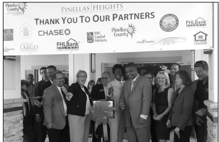
Pinellas Heights opens its doors to low-income seniors.

Pinellas Heights is a mixed-finance community providing 153 one- and two-bedroom units of affordable housing with income-based rents for low-income seniors ages 62 and older. Each unit has Energy Star appliances, emergency assistance pull cords and walk-in showers. The entire community is accessible, and the building has controlled access. On-site amenities for active senior