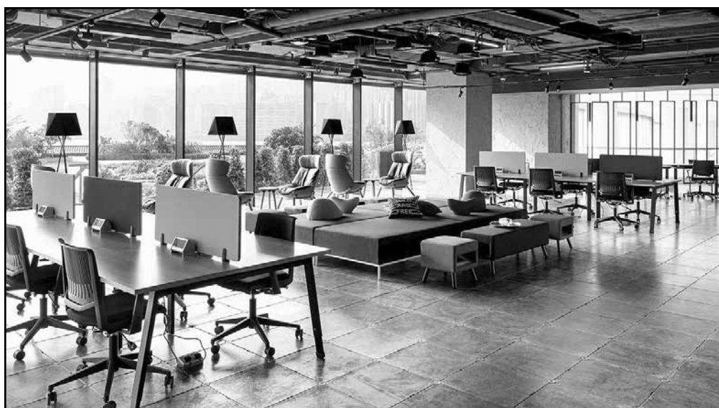
A PHA cannot deny the right to use a community room based only on the viewpoint of the organization that wishes to use it.

Perry Educ. Ass'n v. Perry Local Educators' Ass'n , 460 U.S. 37,45-46, 103 Sup. Ct. 948, 954-55 (1983) (holding once a forum is deemed to be a limited public forum or a public forum, the government may not limit the use based on the content of the message of the user, or the characterization of how the activity will be conducted, based on its content).