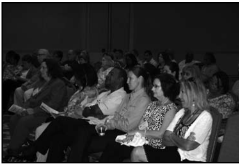
A full house at the General Session: A View From the Bridge - Management Models & Business Plans