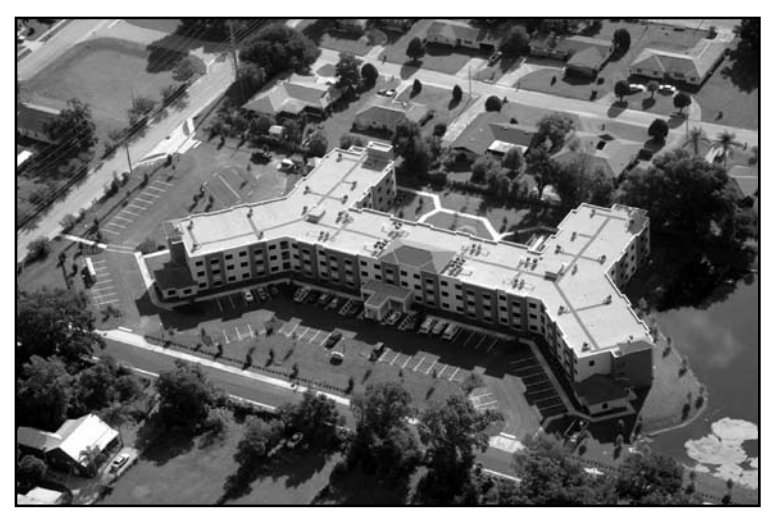
An aerial view of The Manor at West Bartow

Lakeland Housing Authority in partnership with the Lakeland-Polk Housing Corporation recently completed The Manor at West Bartow, a 100-unit affordable housing building for persons 62 and older. This development meets the need for low-income and very low-income seniors and is especially structured for persons on social security since the rents are very low.