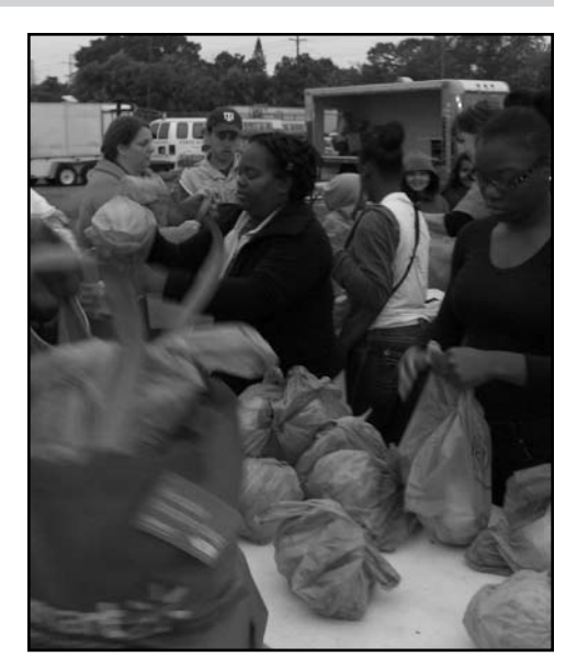
Volunteers arrive early to provide meals to area residents during the annual turkey dinner giveaway in Fort Myers.

The outreach event was held at Cornerstone Ministries. The volume of volunteers willing and ready to work for this cause was phenomenal (many were there at 5:30 a.m.). It was exciting to see everyone working together as a team to provide this wonderful service to Dunbar area residents.