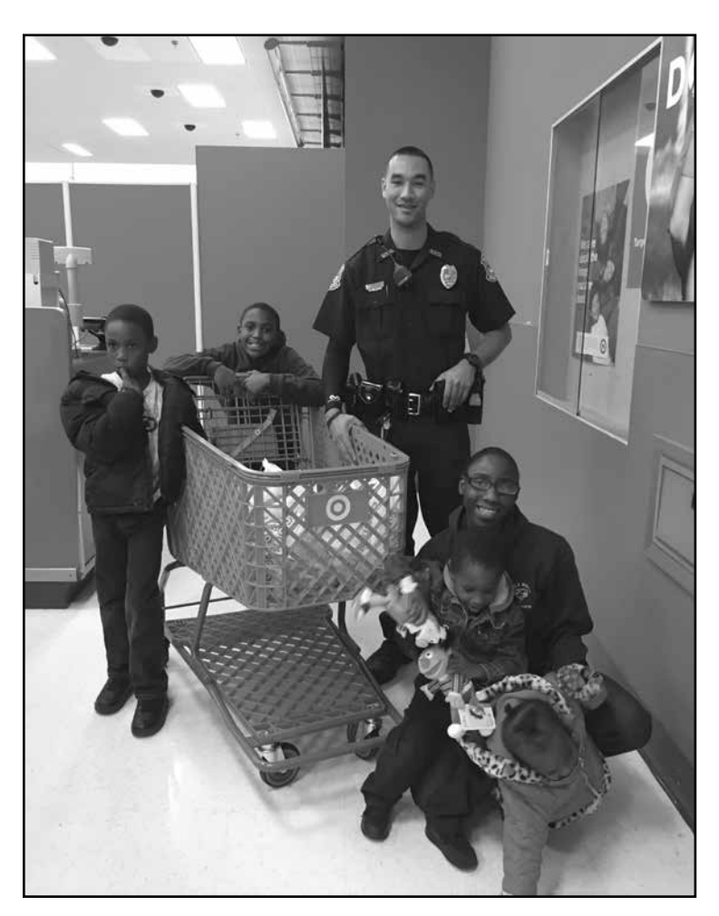
A Sarasota police officer helps children shop for holiday gifts at Target. Donations to the Sarasota Housing Funding Corporation help provide underprivileged children with a Target gift card.