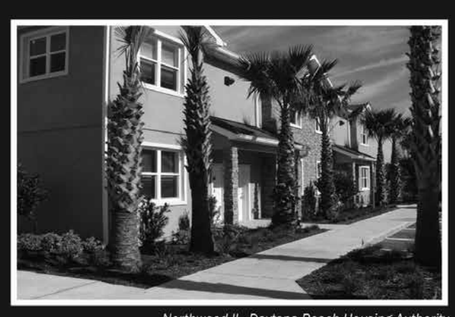
Northwood II - Daytona Beach Housing Authority NAHRO Merit Award Winner