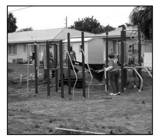
Team Home Depot volunteers work on the playground at the PGHA's Oak Tree Village in Punta Gorda.

In the current economy, it would be logical for businesses to eliminate all extra services and concentrate only on their basic operations. Many companies have had to focus primarily on maintaining their core business and waiting until the markets improve. So it is especially gratifying when a company understands the plight of the community and its nonprofits and agencies that serve those most in need and continues to assist them in their efforts.