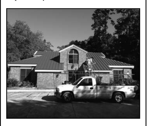
Roofers and painters put the finishing touches on FAHRO's new offices in Tallahassee.

FAHRO is moving into new offices in Tallahassee. Update your FAHRO address to 1390 Timberlane Road, Tallahassee, FL 32312, and make plans to visit us during your next trip to Florida's capital city.