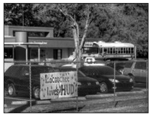
Lacoochee loves HUD.

The residents of Lacoochee had a vision to improve their future. They found the way to work with their government and to get grants to provide the resources they need. Such grant, recently awarded by HUD, will be crucial; it will help the