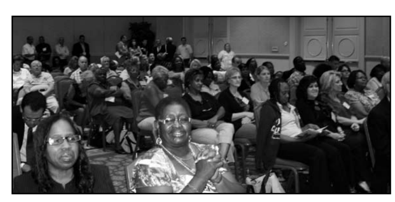
The opening session is standing room only.