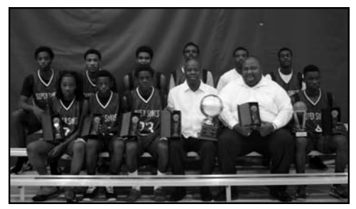
2014 FAHRO Kings of the Court: Daytona Beach Housing Authority