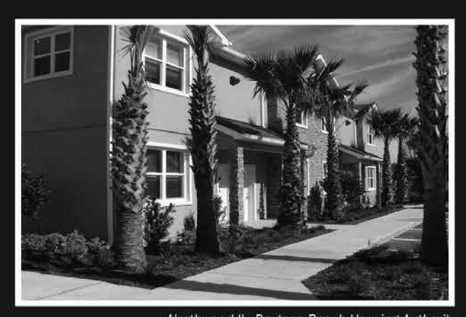
Northwood II - Daytona Beach Housing Authority NAHRO Merit Award Winner