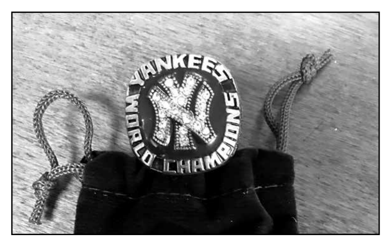
For baseball enthusiasts only! An authentic 1977 New York Yankees Championship ring is ripe for the taking at the Silent Auction.