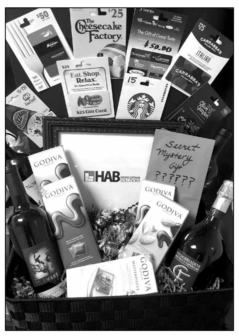
The gift basket to end all gift baskets ... It was one of the more coveted items at this year's Silent Auction.