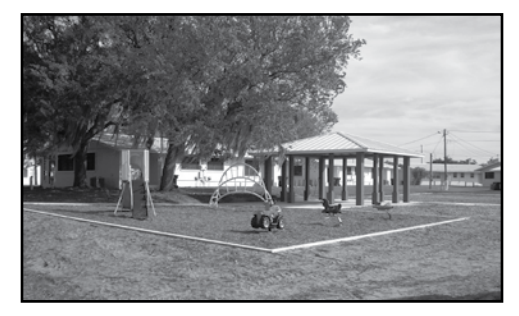
The new tot lot at Lakeside Park is ready for children to come and play.

ter and energy consumption "greening" savings to minimize utility costs to the authority. In addition, the revamped site includes a small pavilion, tot-lot, commercial laundry facility and community vegetable garden.