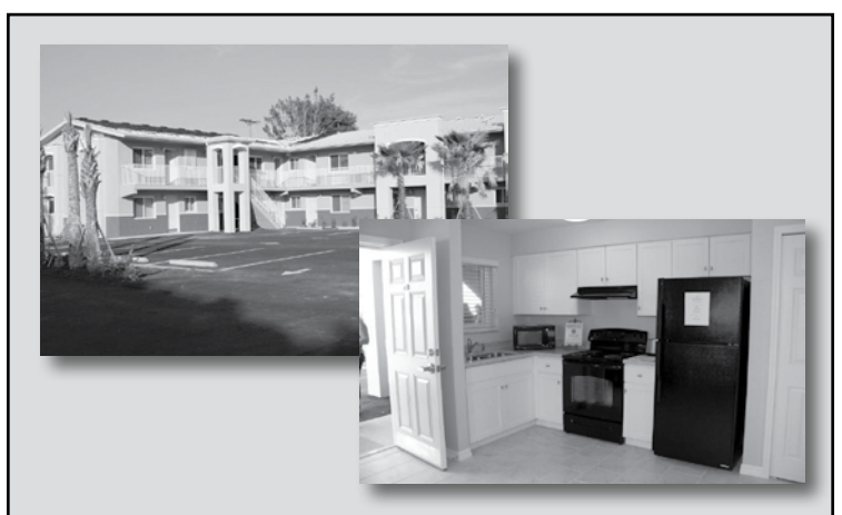
Congratulations to the Housing Authority of the City of Fort Myers' Broadway Apartments on becoming Lee County's and Florida's first LEED Platinum affordable housing development!

Progresso Point is also a socially conscious community providing special needs housing for former foster youth. Working closely with Child Net Inc. and the Fort Lauderdale Training and Education Center, four of the property's one-bedroom apartments have been set aside for young people who "age out" of the foster care system. Affordable rents, money-saving green features and a location near transit, schools, work and recreation make Progresso Point Apartments a perfect place for young adults to call home.