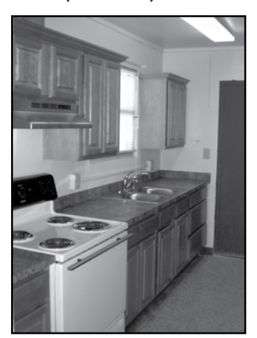
New cabinets await residents in this renovated kitchen at Lakeside Park.

the corner on implementing a project that will transform 16 of its public housing family units into a complex to assist homeless families. The project was made possible with combined funding from the State of Florida State Apartment Incentive Loan Program and Federal Home Loan Bank of Atlanta, Ga., totaling $1.3 million in rehabilitating a portion of the authority's Lakeside Park housing development. Families admitted to the development will enjoy newly remodeled bathrooms, new appliances, lighting, kitchen cabinets, central heat and air, security window and door screening, interior and